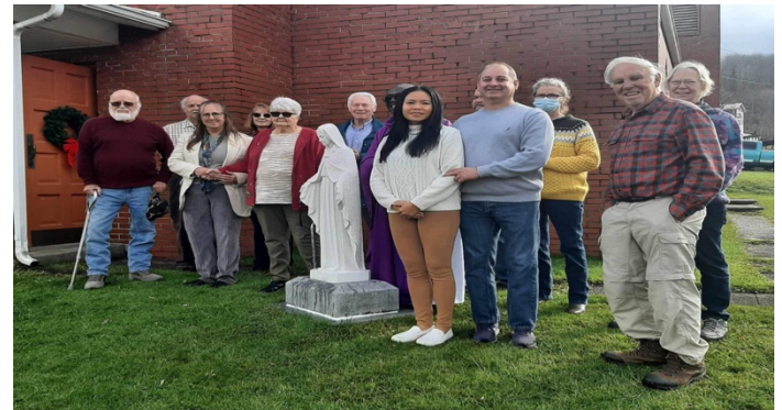
Dedication of the new Mary statue at Sacred Heart in Pickens.