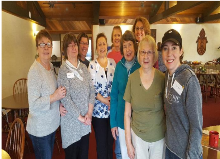
Holy Rosary Parishioners attended the Women Bearing Gifts Retreat last weekend.

interest. This is a loving ministry that really brings comfort to a family. Please consider this worthy ministry.