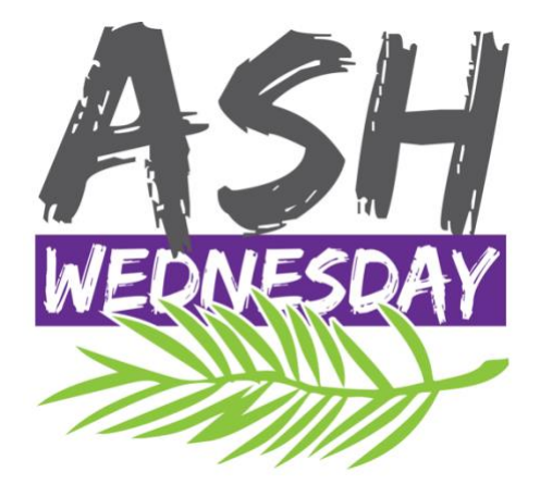
Ash Wednesday February 22 Mass and distribution of ashes at 12:05 pm and 7 pm

We are currently looking for keyboard players for our liturgies. If you play the organ or piano you can help! Training is available. Please call Shirley Lundell if you can assist in this very important ministry!